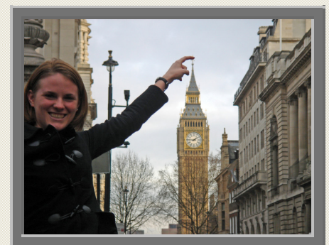
Bellarmino student on the CCSA London Winter Program

KIIS offers summer programs in non-English speaking countries. Most are conducted in English. The academic focus will vary by country. Every year Literature and Theater courses are offered in a variety of locations.