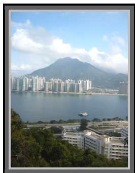
Chinese University of Hong Kong (CUHK): Hong Kong, China View from a dorm room

The list on this page contains links to view course catalogs and/or titles of English courses offered at BU partner universities abroad. Many links provide access to a course description. You should review this list with your Academic Advisor to see which institution will provide you with the courses you need. If necessary, you will also want to discuss substitutions or waivers with the Department Chair.