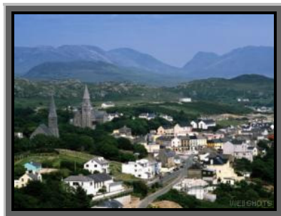
City of Galway, Ireland