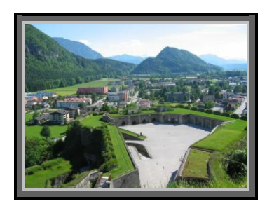
University of Kufstein Tirol: Kufstein, Austria