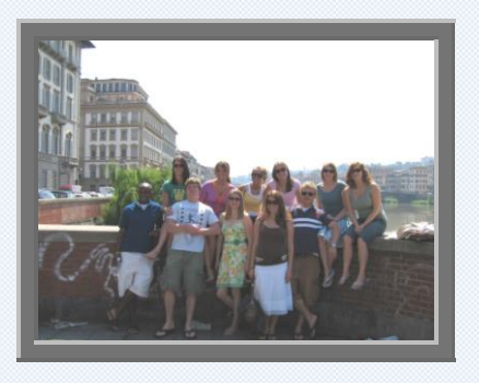
BU Business students in Florence, Italy on the Bellarmine in Europe Program