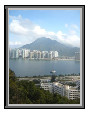
Chinese University of Hong Kong (CUHK): Hong Kong, China View from a dorm room

The list on this page contains links to view course catalogs and/or titles of business courses offered at BU bilateral partner universities abroad. Most links provide access to a course description. You should review this list with your advisor and faculty liaison to see which institution will provide you with the courses you need. If necessary, you will also want to discuss substitutions or waivers with the department chair.