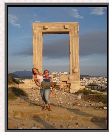
BU student abroad on a short term KIIS summer program in Greece

KIIS has summer options in non-English speaking countries. Most programs are conducted in English. The focus varies by program. Philosophy and Theology courses are offered on a regular basis.