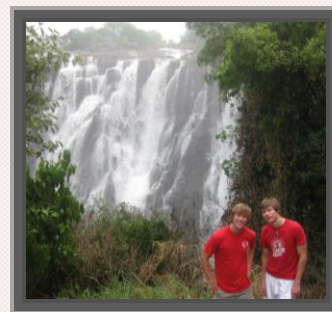
BU students travel to Victoria Falls during a semester in South Africa

In addition to the summer/winter options on this page, there are many international internship and service opportunities available in the social sciences. Please consult the IPO for more information on these programs.