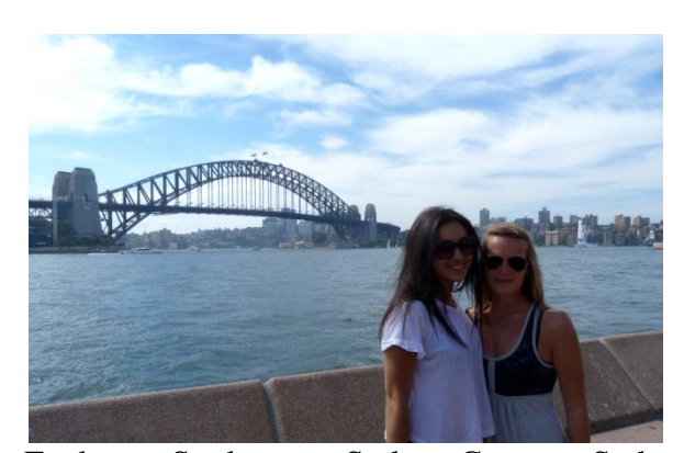
Exchange Students on Sydney Campus, Sydney Harbour Bridge