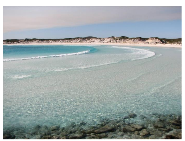
Western Australia Coast