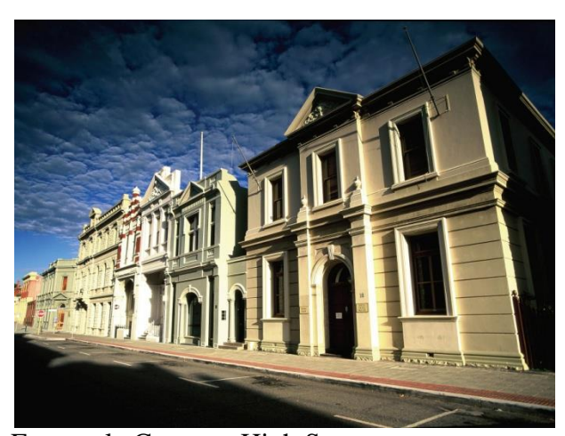
Fremantle Campus, High Street

Please add below photos of your institution, city, and/or country: