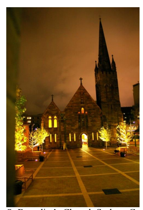
St Benedict's Chapel, Sydney Campus