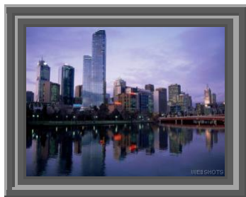
City of Melbourne, Australia Location of Swinburne University and one of the campuses of Australian Catholic University

The lists on this page and the next contain links to view information on communication programs offered at BU partner universities abroad. Many links provide access to a course description. You should review this list with your advisor or faculty liaison to see which institution will provide you with the courses you need. If necessary, you will also want to discuss substitutions or waivers with the Department Chair.