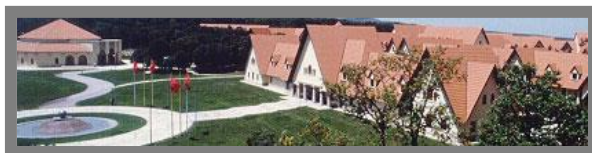
Al Akhawayn University campus: Ifrane, Morocco