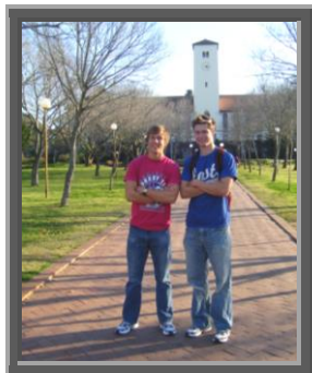
Rhodes University: Grahamstown, South Africa

The list on this page contains links to view course catalogs and/or titles of philosophy and theology courses offered at BU partner universities abroad. Most links provide access to a course description. You should review this list with your advisor to see which institution will provide you with the courses you need. If necessary, you will also want to discuss substitutions or waivers with the Department Chair.