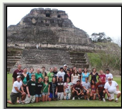
Tropical Biology program in Belize

KIIS offers summer programs in non-English speaking countries. Most are conducted in English. The academic focus will vary by country.