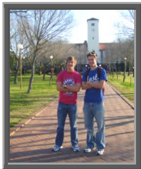
Rhodes University: Grahamstown, South Africa

The list on this page contains links to view course catalogs and/or titles of philosophy and theology courses offered at BU partner universities abroad. Most links provide access to a course description. You should review this list with your advisor to see which institution will provide you with the courses you need. If necessary, you will also want to discuss substitutions or waivers with the Department Chair.