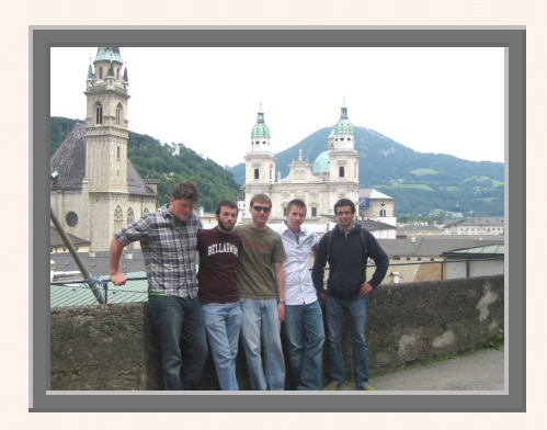
BU Music students in Salzburg, Austria on the KIIS summer program.

KIIS offers summer programs in non-English speaking countries. Most are conducted in English. The academic focus will vary by country. The KIIS Italy program has an art focus. KIIS also has an excellent program for Music majors in Salzburg, Austria.