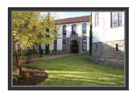
Rhodes University Grahamstown, South Africa