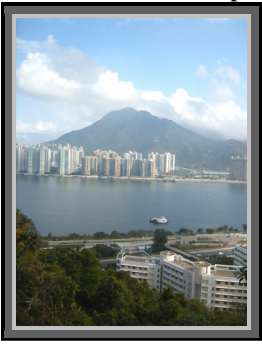
Chinese University of Hong Kong (CUHK): Hong Kong, China View from a dorm room

The list on this page and the next contains links to view course catalogs and/or titles of Music and Music Technology courses offered at BU partner universities abroad. Many links provide access to a course description. You should review this list with your Academic Advisor to see which institution will provide you with the courses you need. If necessary, you will also want to discuss substitutions or waivers with the Department Chair.