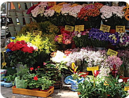
BARCELONA IN BLOOM