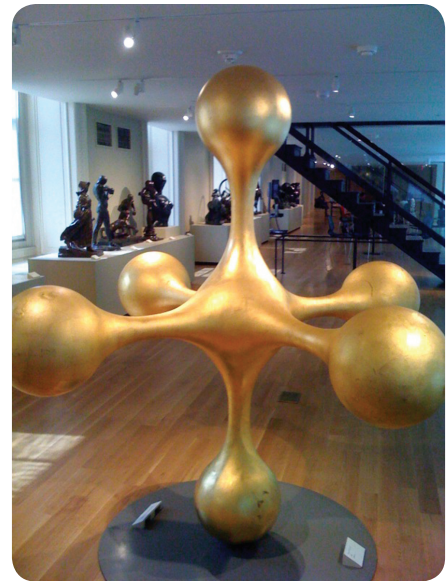
NATIONAL PORTRAIT GALLERY WASHINGTON, D.C.