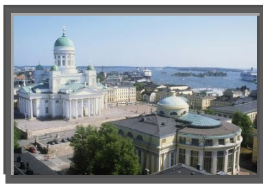
University of Helsinki: Helsinki, Finland