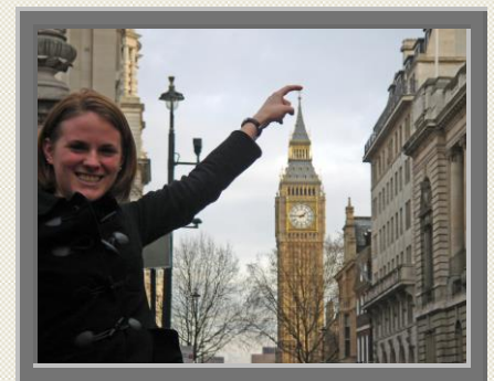
Bellarmino student on the CCSA London Winter Program

KIIS offers summer programs in non-English speaking countries. Most are conducted in English. The academic focus will vary by country. Every year Literature and Theater courses are offered in a variety of locations.