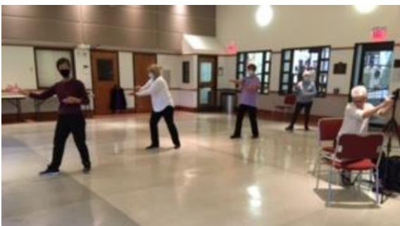
Learning Tai Chi movements