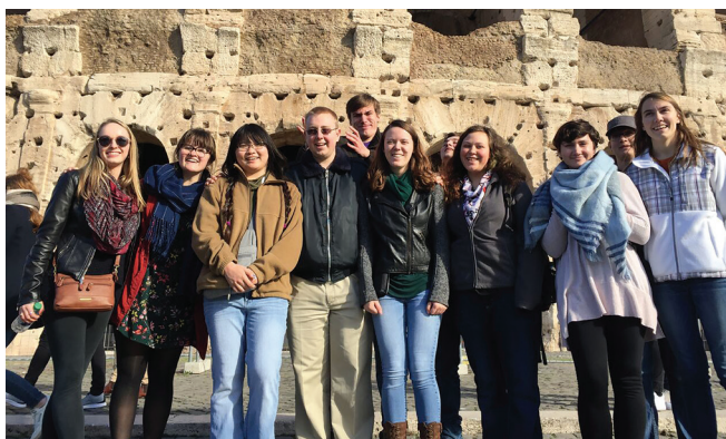
Members of the HONR-320 course pose in front of the Colosseum

12 Honors students and faculty will travel to Belize between May 5-May 14 as part of the HONR-320 History of Belize course. Students will spend the second half of the spring semester examining Mayan/Belizean history, Belizean music, Belizean culture, Belizean/Central American economics and politics, and coral reef ecology. While in Belize, students will snorkel the second largest barrier reef in the world, interact with local Belizeans, learn firsthand about coral reef ecology, visit Mayan temples, and have many more exciting experiences.