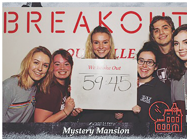
Honors students pose after escaping a breakout room under the time limit