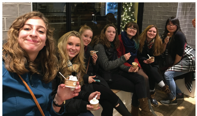
Members of the HONR-320 course enjoy gelato