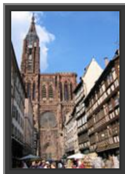
Cathedral in Strasbourg, France