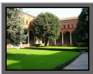
Università Cattolica del Sacro Cuore: Milan, Italy

The list on this page contains links to view course catalogs and/or titles of courses offered at BU bilateral partner universities abroad. Some links provide access to a course description. You should review this list with your advisor to see which institution will provide you with the courses you need. If necessary, you will also want to discuss substitutions or waivers with the Department Chair.