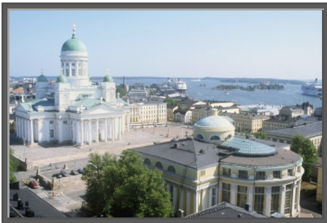
University of Helsinki: Helsinki, Finland

The list on this page contains links to view course catalogs and/or titles of English courses offered at BU partner universities abroad. Many links provide access to a course description. You should review this list with your Academic Advisor and Faculty Liaison to see which institution will provide you with the courses you need. If necessary, you will also want to discuss substitutions or waivers with the Department Chair.