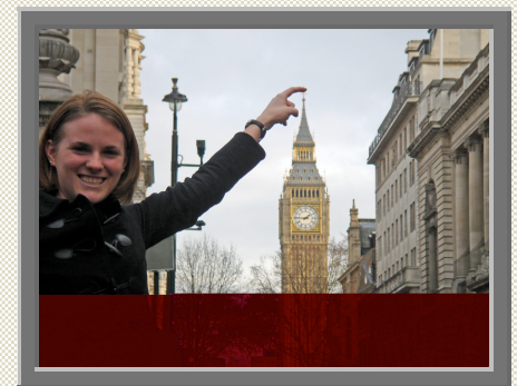
Bellarmino student on the CCSA London Winter Program

KIIS offers summer programs in non-English speaking countries. Most are conducted in English. The academic focus will vary by country. Every year Literature and Theater courses are offered in a variety of locations.