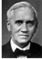
Sir Alexander Fleming

"for the discovery of penicillin and its curative effect in various infectious diseases"