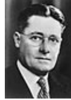
Sir Howard Florey

Read more about the discovery of penicillin and the Nobel Laureates ▶▶