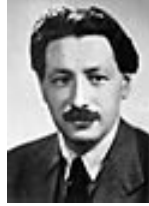
Ernst B. Chain